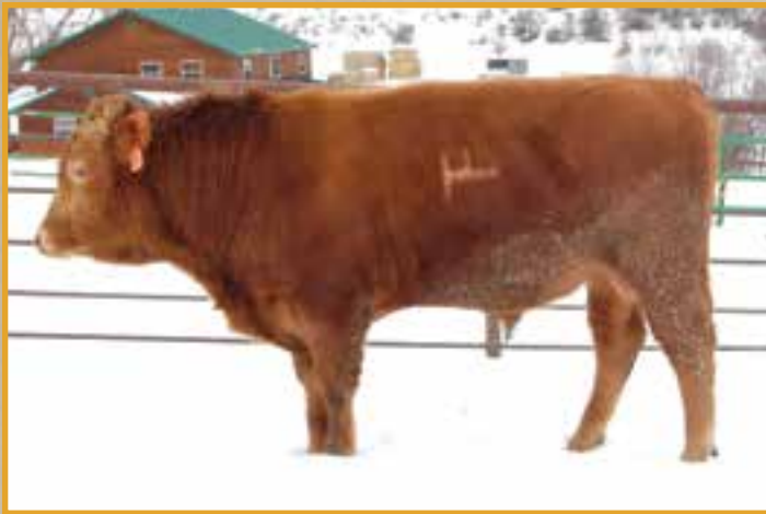
IWG UMEMARU 69Z • SEMEN SELLS AS LOT 83