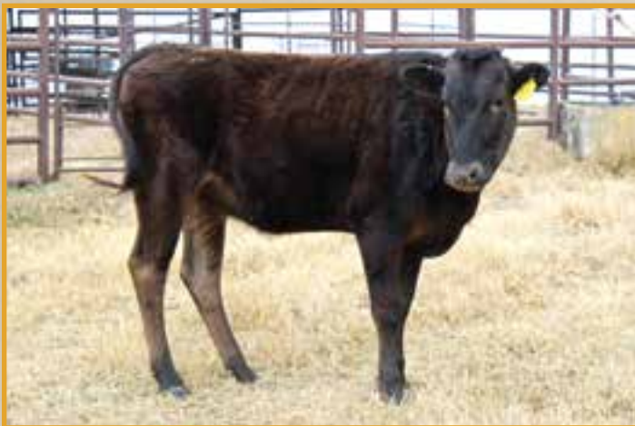
LTR Ms YAKIKOKO 5 • SELLS AS LOT 20