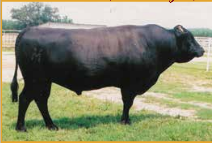
SANJIROU • PATERNAL GRANDSIRE OF LOTS 55-57