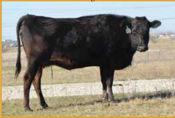
TJP 112X • SELLS AS LOT 29