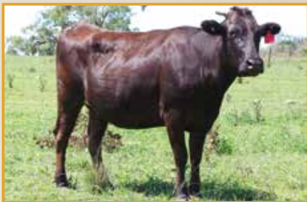
BALD RIDGE DONATA B238 • DAM OF LOT 96

One of our favorite black cows. Large framed, great temperament and easy doing. By Terutani 40/1, one of the best allround black bulls in Australia. Free of all genetic conditions. Embryos by Ginjo Marblemax, GINFB0901, selected for superior weaning weights, superfine marbling and highly profitable carcasses. Free of all genetic disorders.