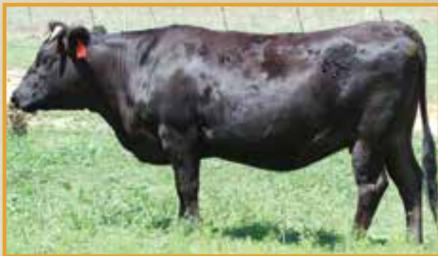
BALD RIDGE HAYAFUKU B240 • DAM OF LOT 95

This is definitely one of our best black cows. Exceptional Breedplan figures and Plus $33 for feedlot index. A really easy doing, fleshy cow with a great temperament. Her calves are among the best, F500 (out of B240) is the bull we have used extensively over our herd. Free of genetic disorders. Embryos are by GRSFF0146, a Terutani 40/1 son who is extremely well regarded in Australia. Free of genetic conditions.