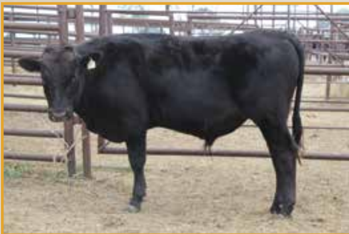
LTR SHIGEFUJI 307 • SELLS AS LOT 64

This is a great young bull with terrific pedigree. He is the son of Haruki-2 and his dam has Itomichi 1/2, Michifuku, and Takazakora in the blood lines. He tested free from all 5 recessive disorders including F11 and will make a great herd bull.