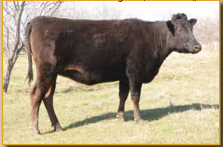
TJP 100Z • SELLS AS LOT 61