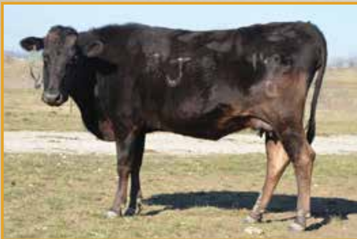
TJP 143X • SELLS AS LOT 30

ITOSHIGENAMI SHIGESHIGENAMI 10632 SHIGEKANANAMI 6109 SHIGEMITSU FUKUMASA YUKIZAKURA FUKUYUKI JVP FUKUKANE 402E JVP FUKUTSURU-068 JVP CHISAHIME 662 LAKE WAGYU Y011 JAPANESE COW Safe in calf to Tangus Bull - EL CORDOBES 214