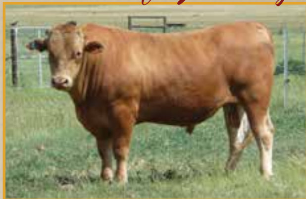
KALANGA RED STAR • SIRE OF LOT 102

Top producing cow with a great temperament. An easy doing cow with a large frame. By Red Emperor. F11 Free. Female embryos by Red Star. Red Star is the largest framed Wagyu bull we have in our herd. He is by Heartbrand Red Star. Very correct, with exceptional EBVs. These female calves would have unlimited potential. Red Star is F11 Free.