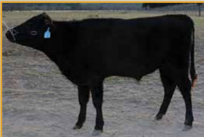
TRR HARUKI CUATRO • SELLS AS LOT 63