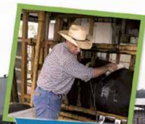
Carcass Ultrasound & Fertility Testing Included

Visit our website or contact us for nomination forms and pricing.