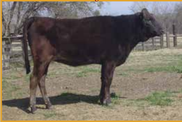
KR Ms MICH 137 • SELLS AS LOT 19