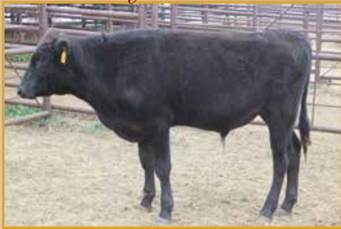
LT SHIGEFUJI 304 • SELLS AS LOT 65

LTR Shigefuji 304 is a out of our TF 147 Daughter of Itoshigefuji 100 (FB319) . This cow is one our best foundation animals and thus far has produced offspring with tremendous growth potential and they grow fast. The Sire of LTR Shigefuji 304 is Shigeshigetani 100 (FB2907). Shigeshigetani 100 is without doubt one of the most sought after bulls in the Wagyu world. His semen is rare and expensive. We believe this bull has the ability to produce calves with outstanding marbling and tremendous growth potential. Looking back to when I started breeding Wagyu Cattle, if we had been afforded the opportunity to purchase a bull with this genetic makeup, it would have saved us a few years of breeding up. This is a great opportunity, this bull will produce great calves with a powerful pedigree. Free of genetic disorders.