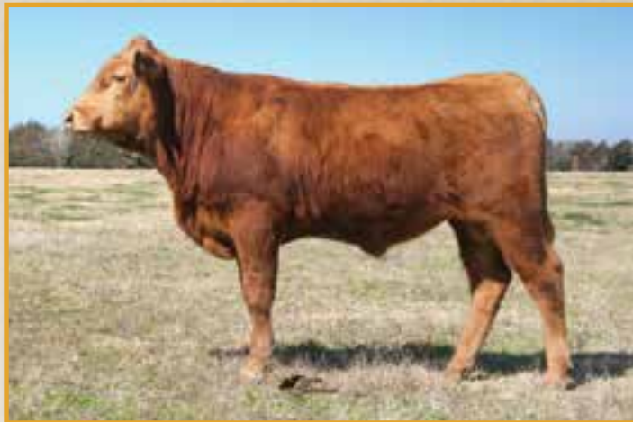
JC UMEMARU 8345 • SELLS AS LOT 82

With 75% Wagyu and 25% Angus genetics, this fancy composite bull will provide a boost of hybrid vigor and carcass quality to a purebred or commercial herd. He is quite thick and docile. When mated to red cows, all offspring will share his desirable, red coat color. Like all cattle we sell, he is vaccinated, de-horned, and accustomed to people.