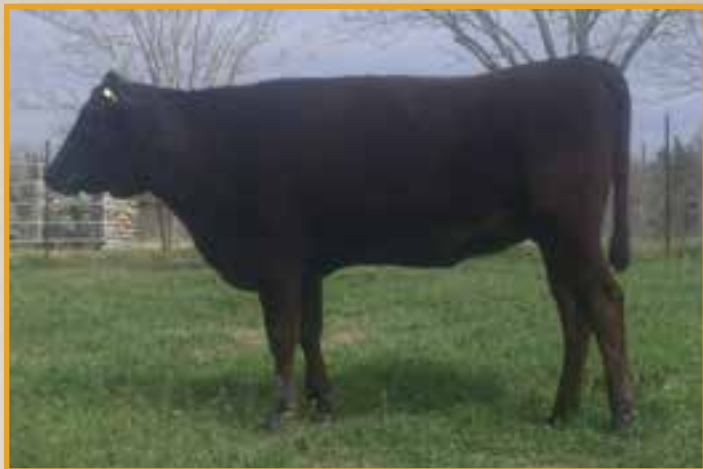
KR Ms ITOMICHI 142 • SELLS AS LOT 17