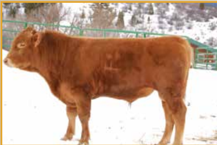
IWG RUESHAW 74Z • SEMEN SELLS AS LOT 84

Ten straws of Red Wagyu semen. CSS qualified. Shipping cost for the semen are the buyers responsibility from Hoffman Breeders, Logan Utah. Free of genetic defects.