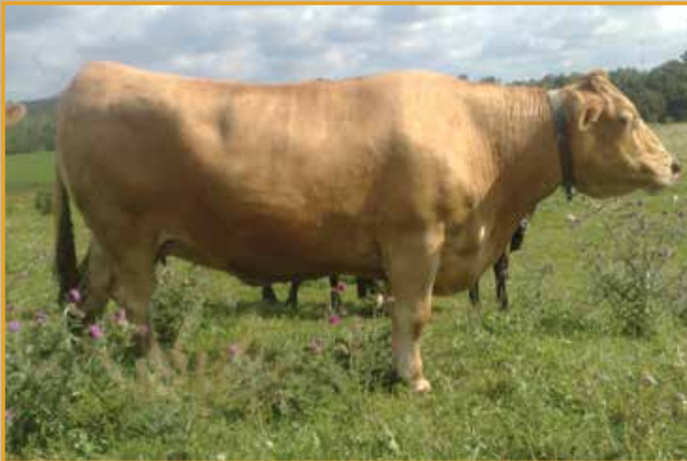
KAEDEMARU • CLONING RIGHTS SELLS AS LOT 1