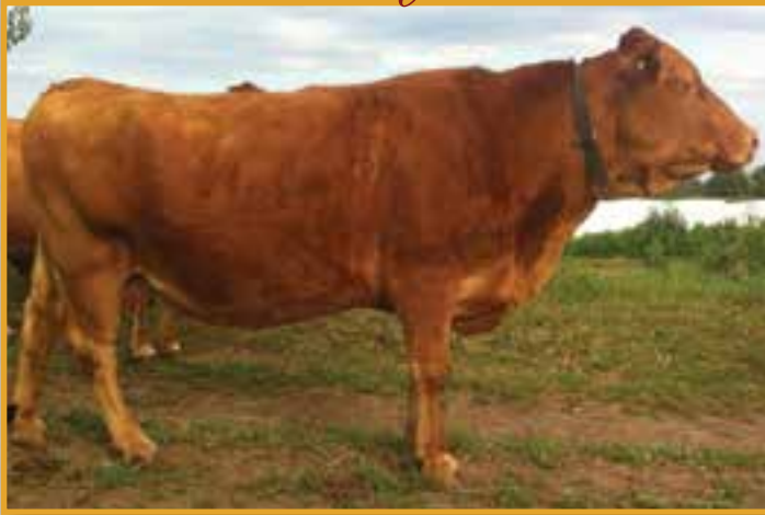
WSI Dai 2 Momigi • Dam of Lot 78