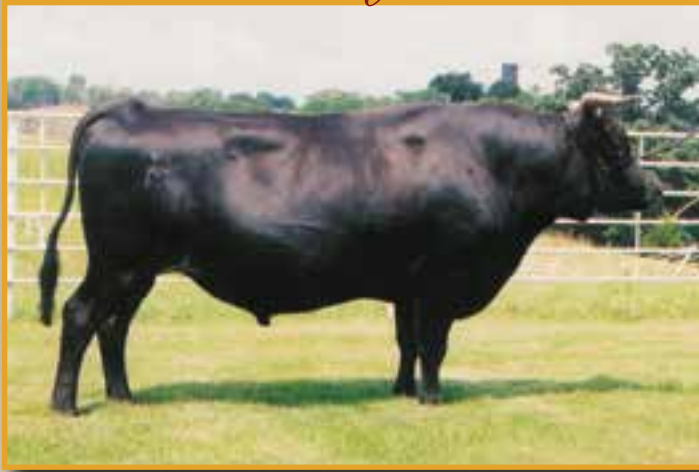
MICHIFUKU • SIRE OF LOT 69, GRANDSIRE OF LOTS 70-71