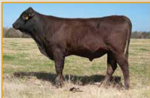
JC RUESHAWSAN 65 • SIRE OF LOT 105

Donor is our super cow #10, whose embryos were the top sellers in the 2013 sale. She ranks high in our herd for strength, depth, and muscling. Her sire, Takeda's Itoshigenami 148, is the only foundation bull from the famous "Nami" line, which some breeders regard as the best Tajima sub-strain due to the fineness of the marbling and meat texture. The sire of these embryos is our impressive black Rueshaw son, #65, half-brother to the #1 marbling Wagyu (an astonishing Avg. Prime) & Grand Champion Red Bull at the 2014 Houston Livestock Show. His pedigree blends the rare genetics of his Japanese National Red Champion sire with stellar carcass quality in his dam's lineage, which includes Sanjirou and Kitateruyasudoi. With a balance of 50% Tajima, 31% Kumamoto red, & 19% Fujiyoshi genetics, there was a low (1%) inbreeding coefficient in this mating. The highly desirable traits from these bloodlines and the superb conformation of the sire and dam will produce top quality females. One can expect excellent marbling plus above average milk, frame, and growth. Free of genetic disorders. Note: Semen sorting is 90% accurate.