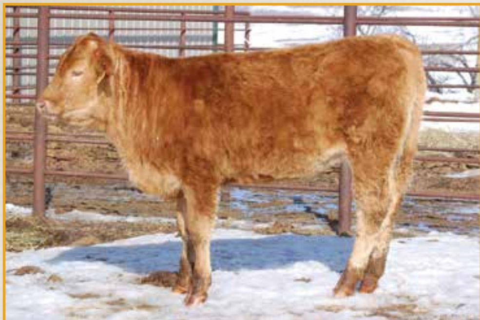
IWG Ms RUBI 98 • SELLS AS LOT 2

Rubi 98 is from excellent genetics being a daughter of Kalanga Red Star. Her dam sired by Shigemaru out of a HB Big AL daughter. Free of genetic defects.