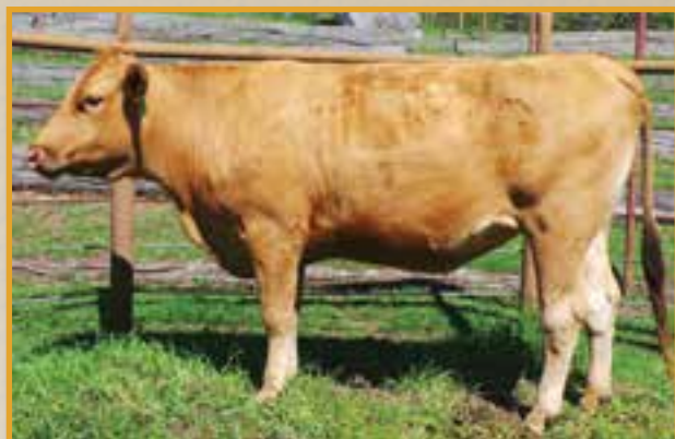
KALANGA EXPRESS FUYUKO E115 • DAM OF LOTS 102, 103

This cow is one of our top producers. Very fertile, easy doing with a large frame. Really nice temperament. By the great Red Emperor. Her EBVs are really up there. F11 Free. Embryos are by Bald Ridge Henshin. A top young sire with excellent EBVs, growth plus. He will become one of the top sires in the breed. By an exceptional son of Kajikari and F11 Free.