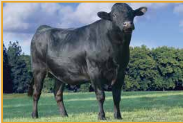
TAKAMICHI DOI • SIRE OF LOT 68