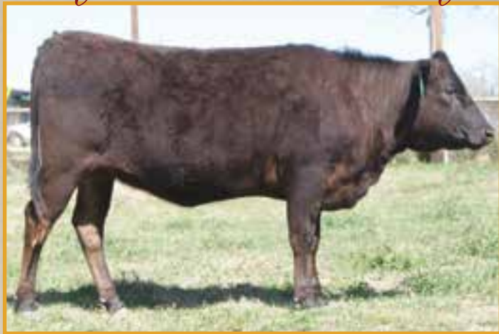
BLB Ms SAZANAMI 1212 • SELLS AS LOT 22