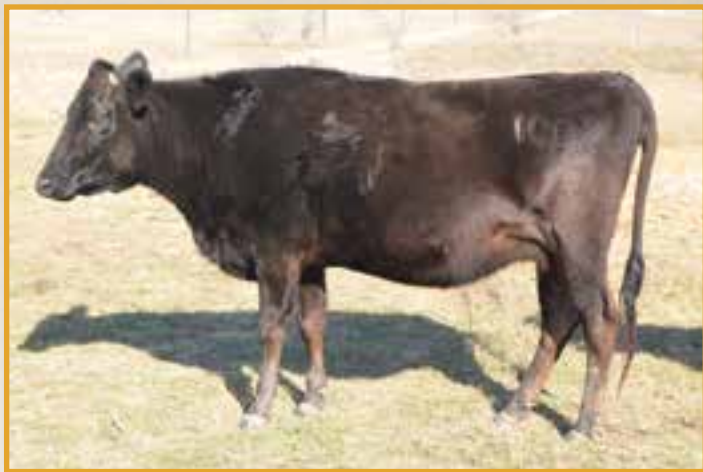
TJP 100X • SELLS AS LOT 28

Safe in calf to Tangus Bull - EL CORDOBES 214