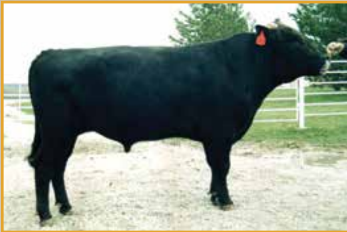
ITOSHIGFUJI • SIRE OF LOTS 32, 34

P.E. to Chiharu from 12/15/13 to 2/15/14