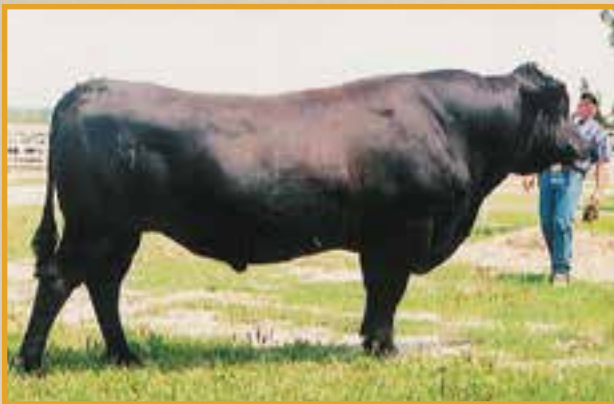
WORLD K'S SHIGESHIGETANI • SIRE OF LOTS 90-91

The Buyer will choose a bull to flush this female to. An IVF flush using Sexed Heifer will be performed and the eggs will be transferred to Greenman Farms recipients. Buyer will get choice of these heifer calves at weaning. Heifer will be tested and guaranteed free of all known genetic disorders. 50% of the purchase price is due sale day, and the other 50% will be due upon delivery of the calf. All shipping and semen costs are the buyers expense.