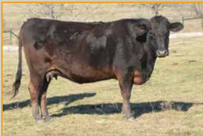
TJP 94X • SELLS AS LOT 27

Sells with calf at side, Lot 27A, a 3/8/14 heifer calf by Tangus Bull - EL CORDOBES 214.