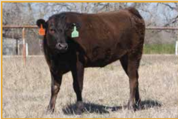
BLB Ms TAIHO 1313 • SELLS AS LOT 18