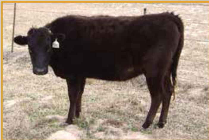
MUTSUNAMI 5941 • SELLS AS LOT 23