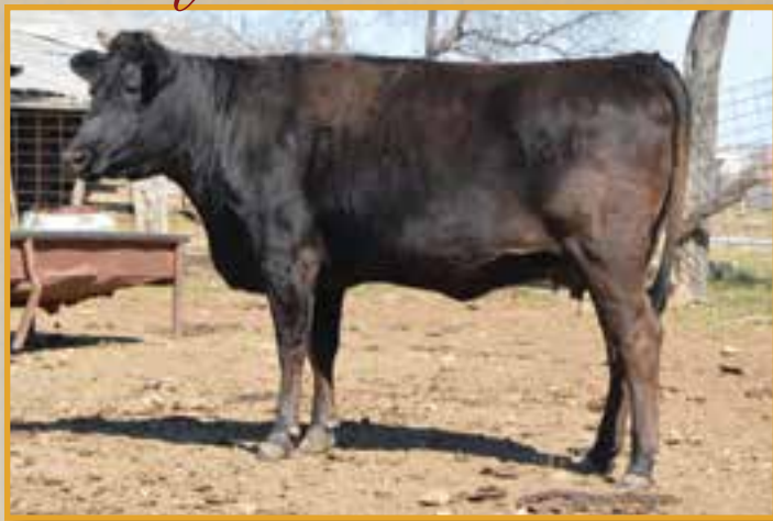
TJP 3212Y • SELLS AS LOT 26

Sells with calf at side, Lot 26A, a 11/13/13 bull calf by Tangus Bull - EL CORDOBES 214.