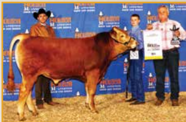
WCC ROCKSTAR • SELLS AS LOT 77

Here he is! The 2014 Houston Reserve Grand Champion WCC Rockstar! This bull was born and raised on 30,000 acres of open desert range in northwest Utah for the first nine and a half months of his life and yet still somehow managed to post a rib eye of 15.42, a BMS of 6.36 and back fat of .24 all at under 14 months old while getting lead and feed bunker broke! A favorite of Japanese cattlemen at the big show in Houston this year, this magnificent specimen is muscular and masculine with good structure and a good way of going. Rockstar boasts an elite pedigree of a Hikari sire line (Hikari is regarded by many of the early US wagyu breeders as the best marbling of the original red sires) stacked on top of a Big AI over Big AI dam. (Big AI has been a stand out, elite growth sire for the entire breed). The best of marbling over the extreme best of growth, stacked up close and personal, what more could you want? Rockstar is the complete package who will only get better as he matures and he will positively impact any registered herd or commercial F1 program. How would a highly mobile, open range raised, yet puppy dog tame, lead broke, Houston Reserve Grand Champion look and perform on your herd? Don't miss your chance to find out!