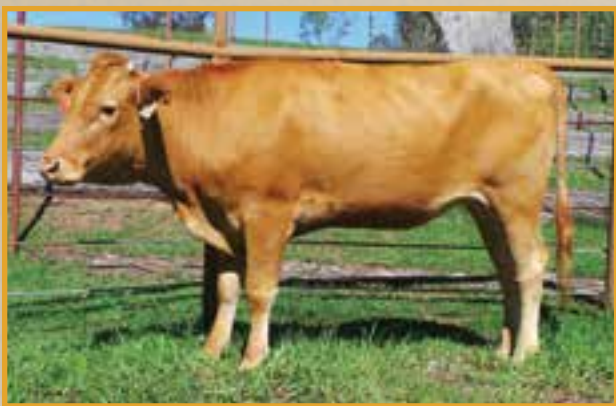
KALANGA TAMAYUKO • DAM OF LOT 107

100 % Red Wagyu embryos. Free of genetic defects.