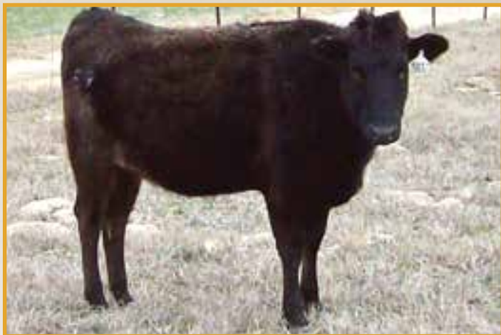
YG 149-5932 • SELLS AS LOT 24