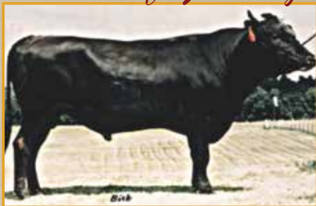
HARUKI-2 • SIRE OF LOTS 92-93