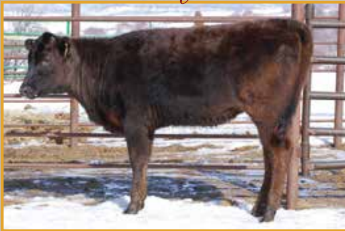
IWG HARUSHIGO 114 • SELLS AS LOT 12