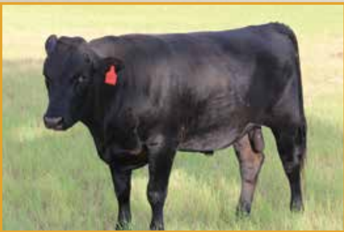
LTR ITOMAZAKEMI 1117 • SIRE OF LOTS 100-101

Offering two lots of five embryos. First buyer has the option to take both sets of embryos. Free of genetic disorders.