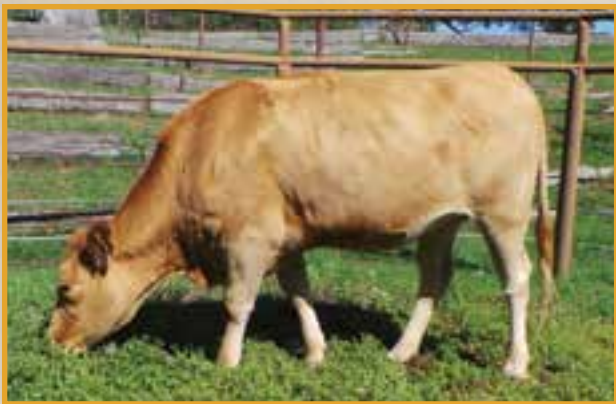
KALANGA TAMAHOMARE G0003 • DAM OF LOT 108

Really nice female, very correct and one of the biggest framed heifers of her drop. Definitely one of our favorites. F11 Free. Embryos by Red Emperor should produce large framed, well put together calves with huge all around potential.