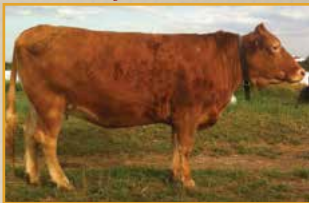
WSI AKIMARU • DAM OF LOT 74

Sired by the show sire, WSI Umamaru-FB9979 and his dam WSI Akimaru-FB14371, one of the very few Fullblood daughters sired by Tamamaru in North America. His maternal grand dam is Dai 2 Mormigi-FB13803 (sired by Shigemaru and recessive genetic free). The maternal great grand dam, "Momigimaru"-FB10979 is sired by the great Japanese Red Sire, Namimaru- FB373. Straight to the heart of the Naomi Family from Wagyu Sekai. This is the sole wSI Umamaru x wSI Akimaru mating. Genetic disorder test pending.