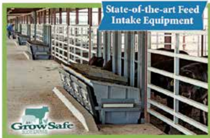
State-of-the-art Feed Intake Equipment

GROWSAFE FEED EFFICIENCY TESTING • CUSTOM BULL & HEIFER DEVELOPMENT