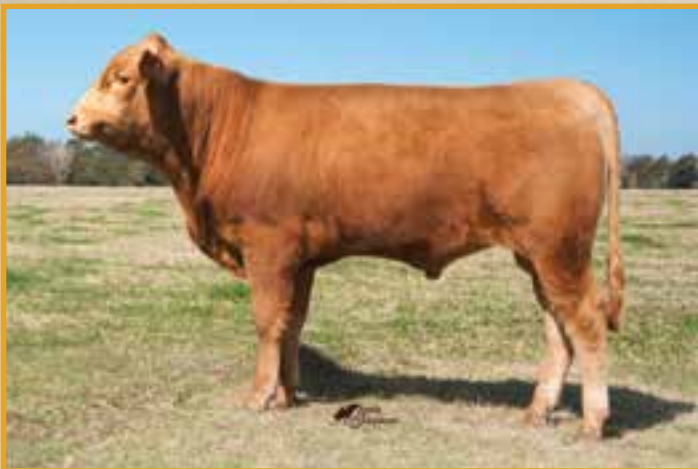
JC RUESHAW 76 • Sells as Lot 79

Take a look and have a drink of Red Rum"!!!! Genetic disorder test pending.