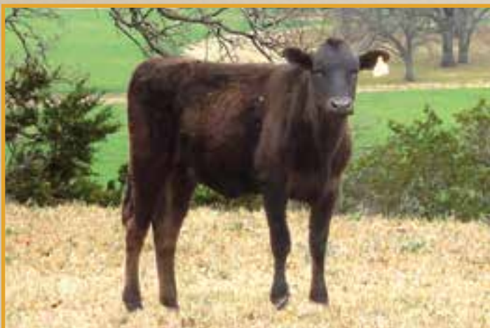
BJ SHIGE 308 • SELLS AS LOT 14