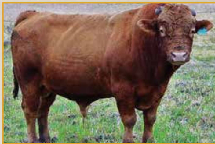
HEART BRAND RED EMPEROR • SIRE OF LOTS 85-87