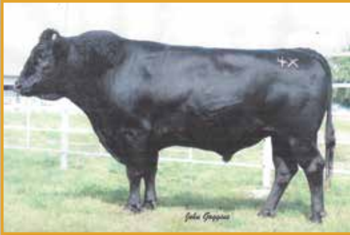
CHR HIRASHIGE 170P • REFERENCE SIRE A