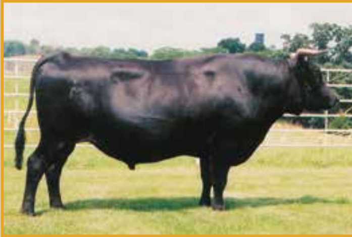
MICHIFUKU • SIRE OF LOT 40, GRANDSIRE OF LOTS 37-39, 41