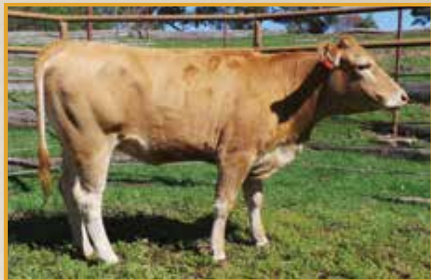
BALD RIDGE HOMARE BLUE - DAM OF LOT 104

Beautiful heifer. Very feminine, large framed and great temperament. Her mother is one of our top cows. F11 Free. Embryos by our young stud sire, Bald Ridge Henshin. A grandson of the great Kajikari. His EBVs are way, way above breed average and climbing. A definite bull of the future. One of the few Kajikari descendants that is F11 free.