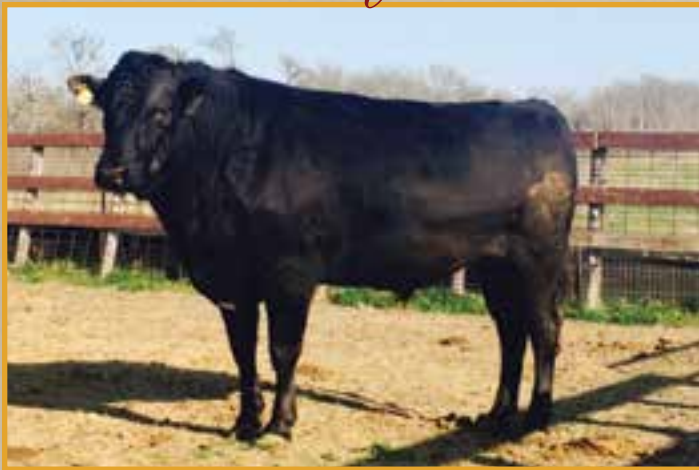
TBR ITOHANA 3 • SELLS AS LOT 72