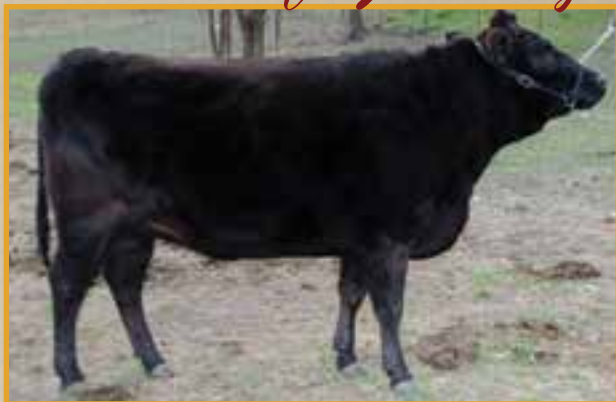
CL Ms ITOMICHI 1/2 • DAM OF LOT 110

Five embryos out of a daughter of Itomichi, 1/2 of that has a Fukutsuru and Takazakura on the dam side. This heifer was purchased at "The Steaks are High" sale in 2012 and produced 28 embryos on her very first flush. The sire of these embryos is Heart Brand Red emperor, a proven red bull with a track record of both high marbling and growth. This combination will yield terrific genetics to add to any herd. The dam tested free from recessive disorders and the sire is recessive disorder free by pedigree.