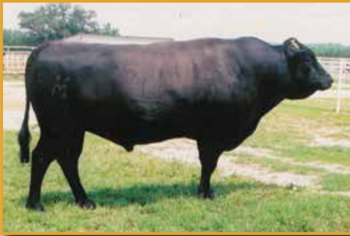
SANJIROU • SIRE OF LOT 99

This is another chance to get some calves out of the best grazers I have ever seen. Her and her calves give my goats a run for their money! The bull, I think could become something really special, just look at his sire. Itomoritaka FB861. That is foundation.