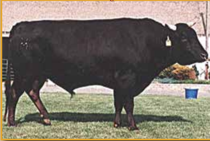
KITAGUNI JR. • PATERNAL GRANDSIRE OF LOT 5