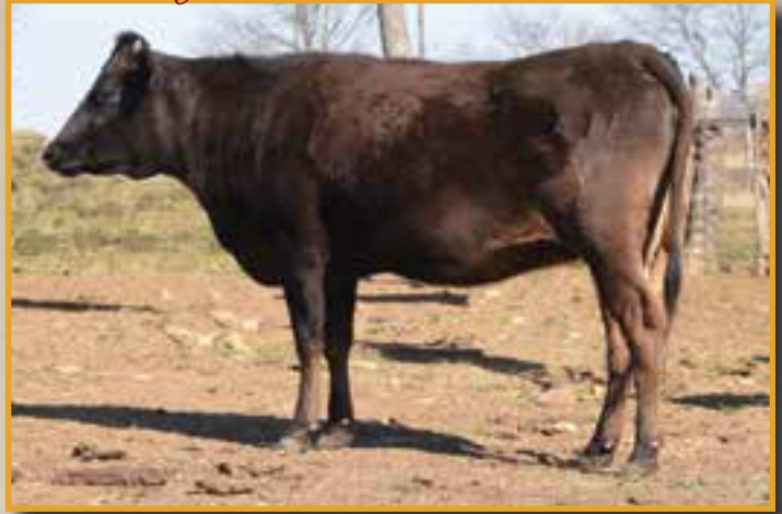
TJP 272Y • SELLS AS LOT 33

Safe in calf to Tanguis Bull - EL CORDOBES 214