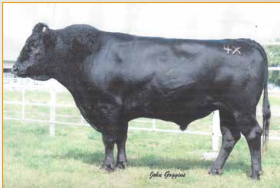
CHR HIRASHIGE 170P • SERVICE SIRE OF LOT 4