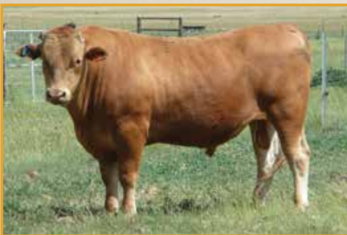
KALANGA RED STAR • Sire of Lot 80