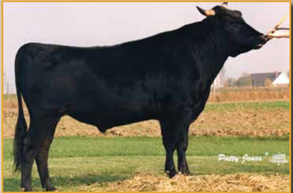
GENJIRO • MATERNAL GRANDSIRE OF LOT 3

Here we have a cow that has all three of World K's "Big Three" in the pedigree. The cow families of the famed Suzutani, Okutani, and Rikitani are all present in this powerful Black pedigree. Fujiko 2 is sired by Hirashigaru-FB11816 (a Hirashigetayasi from a full sister to Shigeshetani). A large framed, high growth sire with extreme marbling. The dam of Fujiko 2 is sired by Genjiro-FB5200 (a full brother to Beiiro-FB2289 and a full sister to Fujiko-FB1984). Beyond this, the maternal line traces direct to Rikitani-FB1618 (made famous by sires Kanadagene 101-FB14909, and Australian sires- Overflow Katsumi, Longford Tojo, Longford Honjo, and Longford Zaki). Safe in calf to "WSI Dai 2 Sanjiro" -FB13797. A rare offering direct from the Rikitani Family. Genetic disorder test pending.