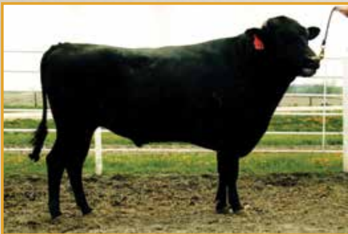
ITOSHIGENAMI • SIRE OF LOTS 27-31, 33