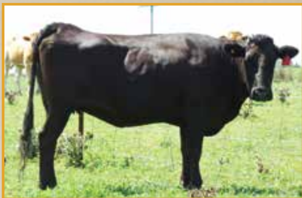
BALD RIDGE HAYAFUKU B224 • DAM OF LOT 94

Large framed cow with really good EBVs. Plus $31 for Fullblood Feedlot Index. Well above breed average. Tested Free of all genetic conditions. A top producer. Embryos by GRSFF0146. A son Terutani 40/1, one of the top allround black bulls in Australia. Free of genetic disorders.