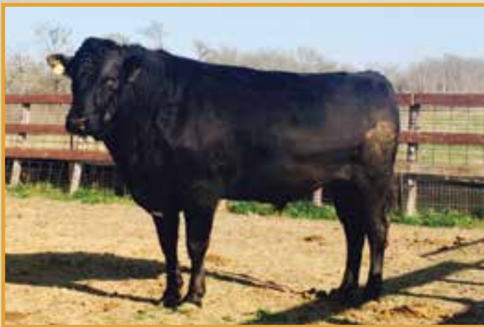
TBR ITOHANA 3 1012X • SELLS AS LOT 72